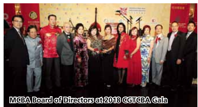
MCBA Board of Directors at 2018 CGTCBA Gala