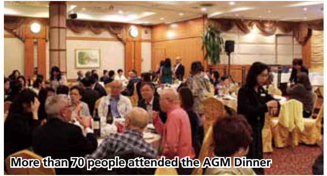
More than 70 people attended the AGM Dinner