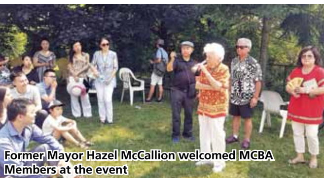
Former Mayor Hazel McCallion welcomed MCBA Members at the event