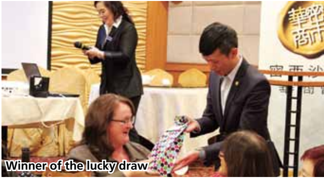
Winner of the lucky draw