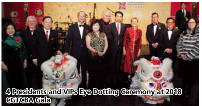
4 Presidents and VIPs Eye Dotting Ceremony at 2018 CGTCBA Gala