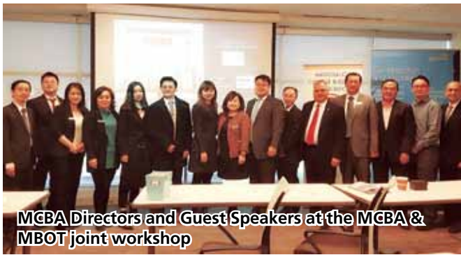
MCBA Directors and Guest Speakers at the MCBA & MBOT joint workshop