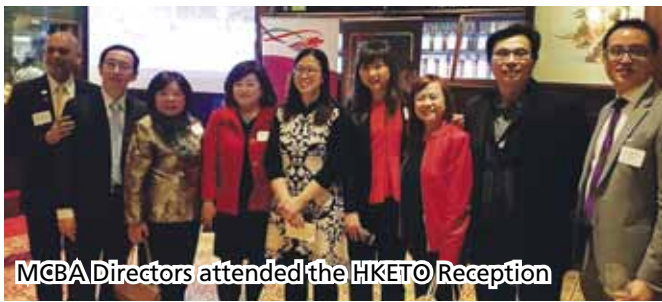
MCBA Directors attended the HKETO Reception