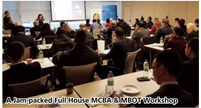
A Jam-packed Full House MCBA & MBOT Workshop