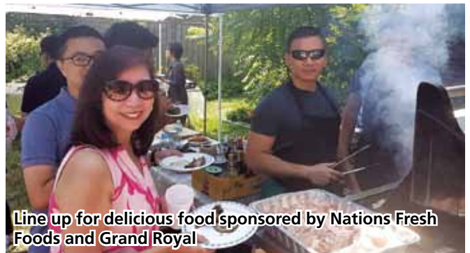
Line up for delicious food sponsored by Nations Fresh Foods and Grand Royal