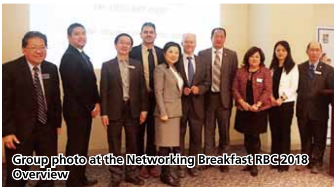
Group photo at the Networking Breakfast RBC 2018 Overview