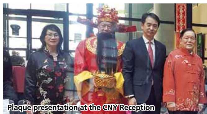
Plaque presentation at the CNY Reception