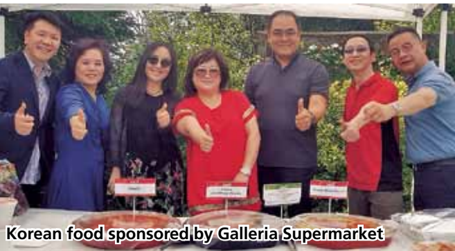
Korean food sponsored by Galleria Supermarket