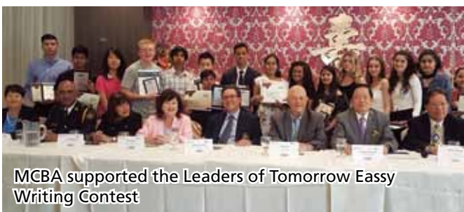
MCBA supported the Leaders of Tomorrow Essay Writing Contest