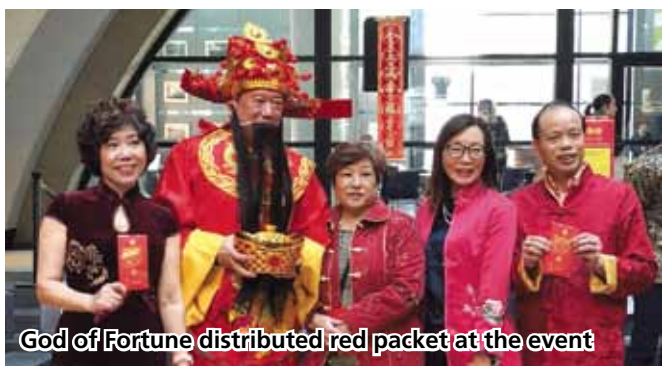
God of Fortune distributed red packet at the event