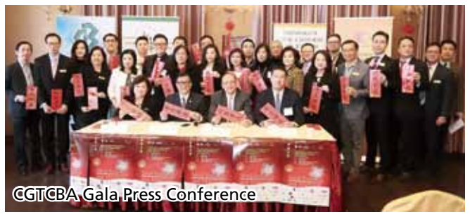
CGTCBA Gala Press Conference