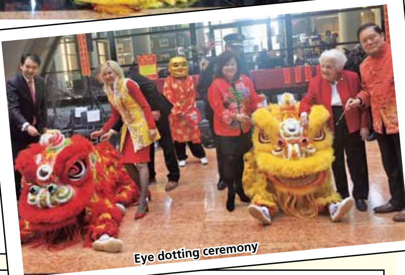
Eye dotting ceremony