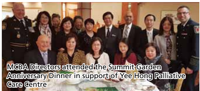
MCBA Directors attended the Summit Garden Anniversary Dinner in support of Yee Hong Palliative Care Centre