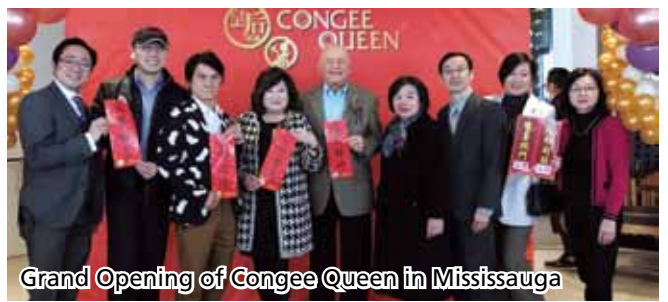
Grand Opening of Congee Queen in Mississauga