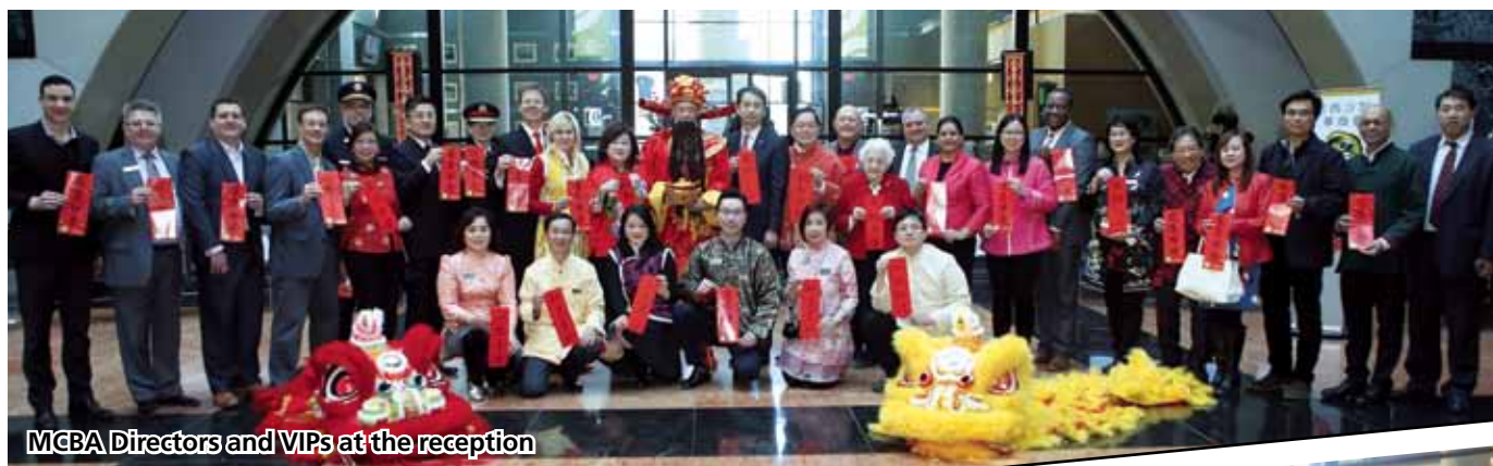
MCBA Directors and VIPs at the reception