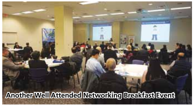
Another Well Attended Networking Breakfast Event