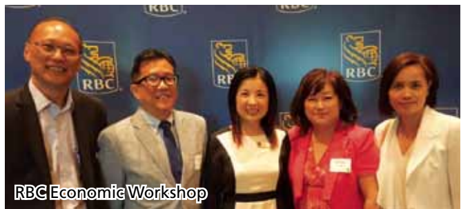
RBC Economic Workshop