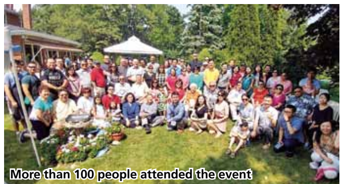
More than 100 people attended the event